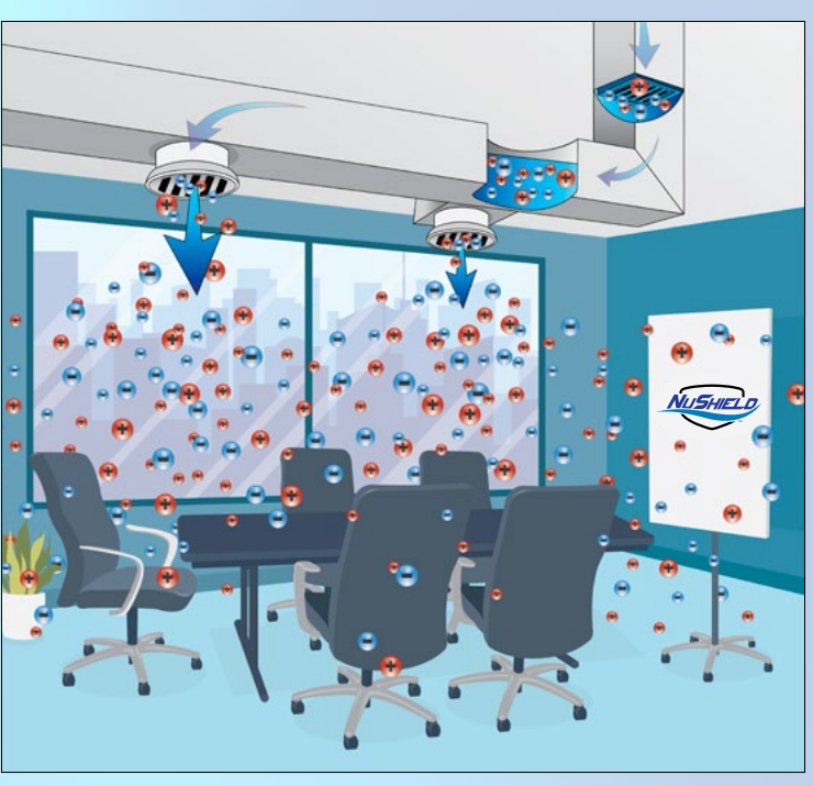
Actual coverage depends on installation and air flow.